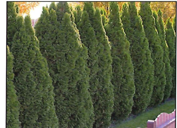
PROPOSED EXAMPLE DOUBLE STAGGERED ROW OF EVERGREEN TREES